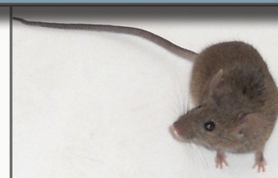
General Pest Control: March 16-17

Courses will be held online AT LEAST through May