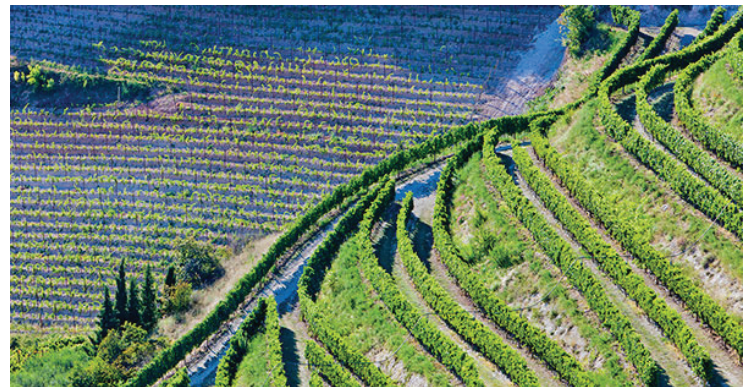
Figure 1. Drones are successfully used in vineyards and orchards for different purposes, including spraying pesticides.